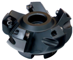
GLW-0773-28-00-00-0 ( 5 inserts required)