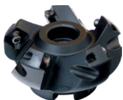
Milling head, (5 inserts required)