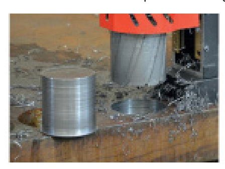
Drilling Capacity up to 5" (127 mm) Max Depth of cut up to 4" (100 mm)