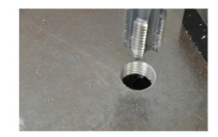
Through and Blind Hole Tapping