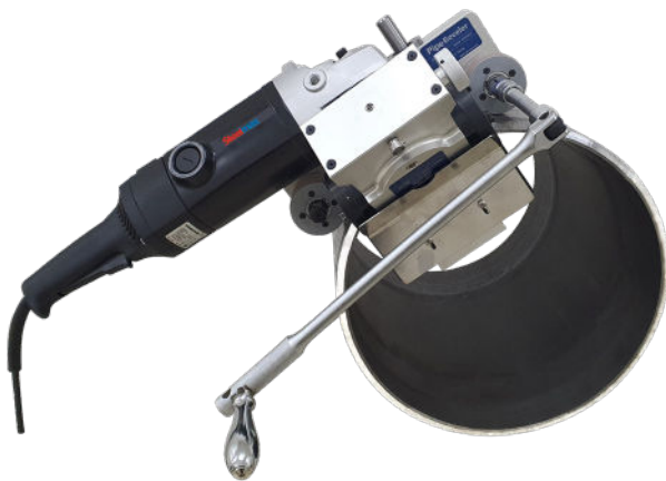
MPB32 Pro MANUAL PIPE BEVELING MACHINE

The MPB32 Pro is a manually operated machine while the APB32 Pro automatically feeds itself around the pipe. Both machines can mount to pipe or tubing with a minimum diameter of 10" and can bevel outside diameters up to 32" and 1/8" up to 3/4" wall thicknesses. With an optional attachment, both the MPB32 Pro and APB32 Pro can bevel pipe of any diameter over 32" making this an incredibly versatile solution.