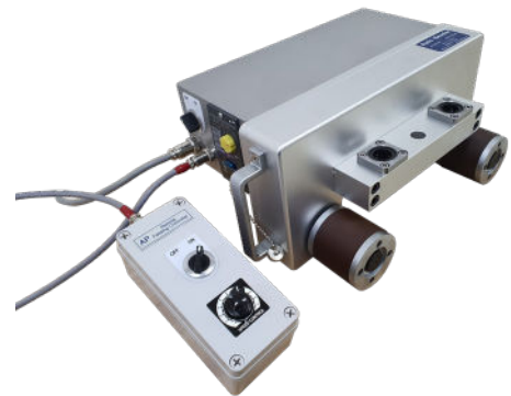
Remote pendant for automatic feed for APB32 Pro