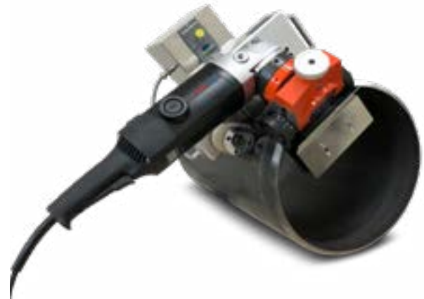
APB32 Pro Automatic Pipe Beveling Machine