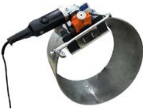
MPB32 Pro Manual Pipe Beveling Machine

The MPB32 Pro is a manually operated machine while the APB32 Pro automatically feeds itself around the pipe. Both machines can mount to pipe or tubing with a minimum diameter of 10" and can bevel outside diameters up to 32" and 1/8" up to 3/4" wall thicknesses. With an optional attachment, both the MPB32 Pro and APB32 Pro can bevel pipe of any diameter over 32" making this an incredibly versatile solution.