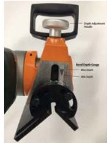
Easily set the bevel depth