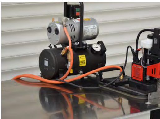
VACUUM SUPPLY (standard configuration)