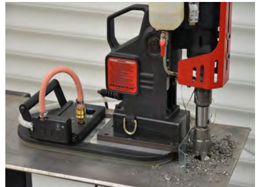
COMPRESSED AIR SUPPLY (optional configuration)