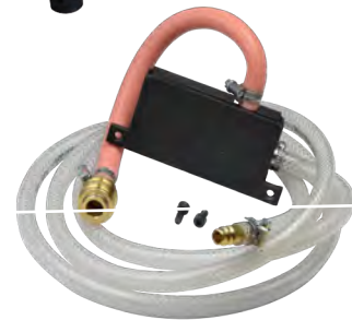
Compressed air ejector SMZSP-0587-11-00-00-0

Optional compressed air ejector generates a vacuum thanks to high flow speed of air according to the Bernoulli principle. The vacuum pad equipped with the compressed air ejector can be an effective solution in numerous industrial plants and workshops, where compressed air pipe system is widely utilized.