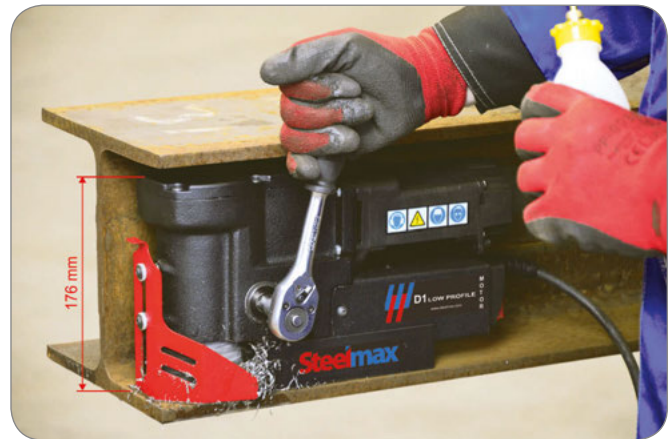
The D1 Low Profile fits in the tightest spots