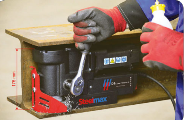
The DI Low Profile fits in the tightest spots