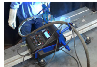
Suitable for work in both horizontal and vertical positions