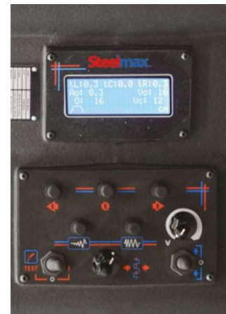
User-friendly control panel